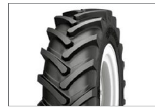
R-1 (ag tread) tire – standard tread