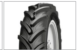
R-1W (ag tread) tire – utility tread, hard or wet surfaces.